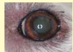
'Dry eye' but appearing relatively normal