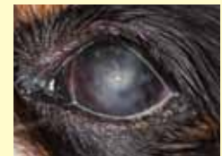
'Dry eye' with more obvious changes