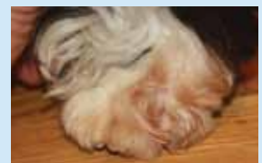
Paw chewing in a dog: Discoloured hair is a sign of excessive grooming.

If your pet gets itchy for no obvious reason, has recurrent ear problems or has a very sensitive stomach – it could be an allergy, so please come and see us for a check-up!