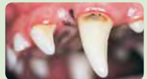
(2) Gingivitis – with early calculus