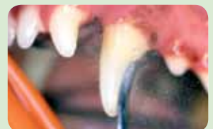
Removing the calculus using an ultrasonic scaler, followed by polishing the teeth is a very effective form of treatment