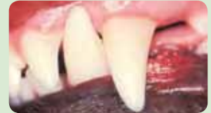
(1) Healthy mouth